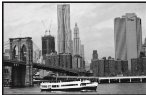
Above: The Brooklyn Bridge, with Lower Manhattan in the background.