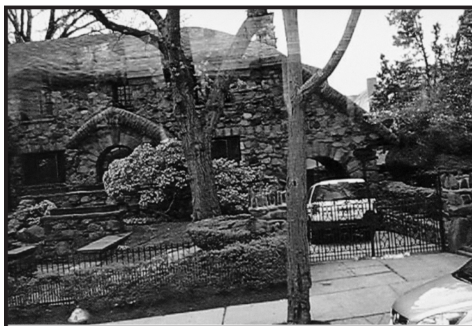
Above: One of the homes that will be decorated when we do the “Christmas Lights Tour,” December 13