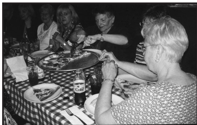
Below: “Digging in” for Grimaldi’s famous Neopolitan style pizza.