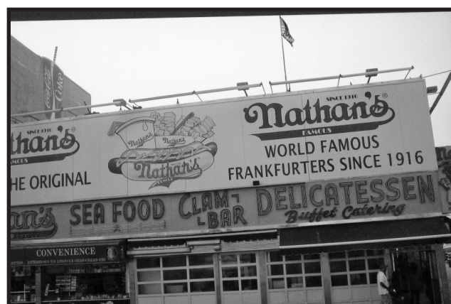
Below: One of Coney Island’s landmarks - Original Nathan’s