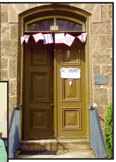
Top: A welcoming entry Below: Our Cruise Directors for the afternoon

A delightful time was had by all at the BCHF Annual Tea. Thanks to all of our wonderful volunteers and to those who attended for making this event a success.